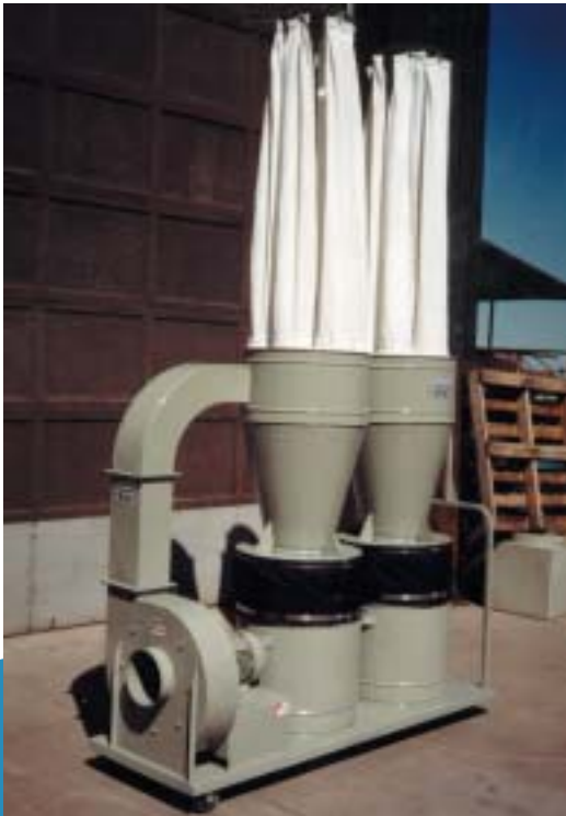
KTM S 22-12 CYN, KTM S 32-12 CYN, KTM S 52-12 CYN