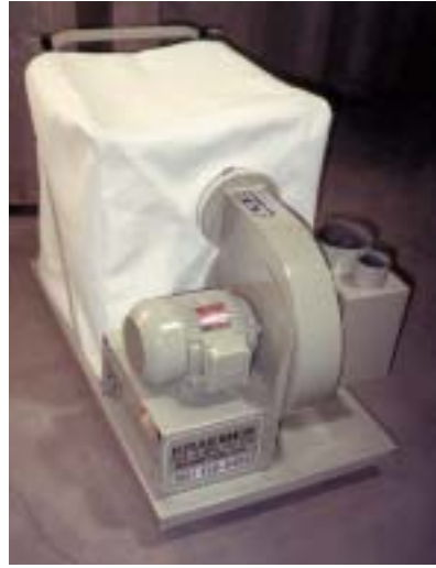
KTM S 2-L