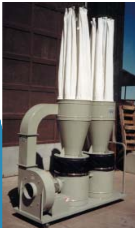
KTM S 52-12 CYN