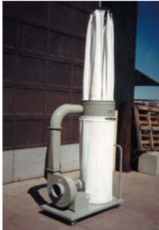
KTM S 2-6, KTM S 3-6, KTM S 5-6 For Mixed Dust

All units come complete with filter bags, clamps and electric switch.