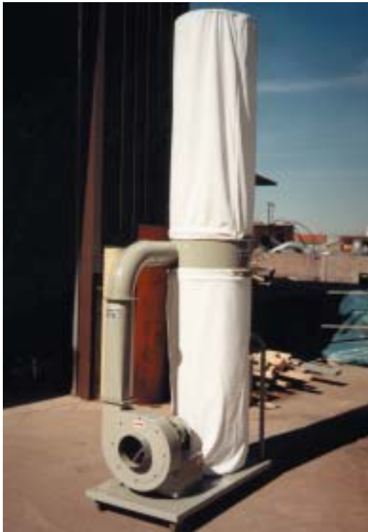
KTM S 2, KTM S 3, KTM S 5 For Coarse Dust