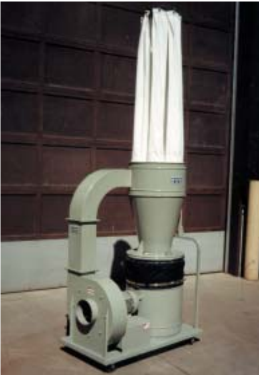
KTM S 2-6 CYN, KTM S 3-6 CYN, KTM S 5-6 CYN