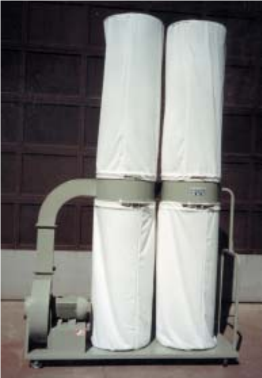
KTM S 22, KTM S 32, KTM S 52

Can be supplied with drums instead of bottom bags at no extra charge.