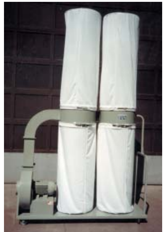
KTM S 52