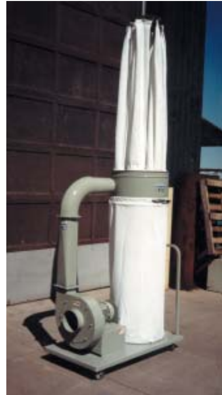
KTM S 2-6