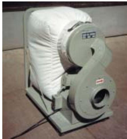
KTM S 1

KTM "S" Type Portable Dust Collectors with 1 or 2 stations: Ideal for Wood, Plastics, Paper, Chemicals, Foodstuff, Metals, Leather and more.