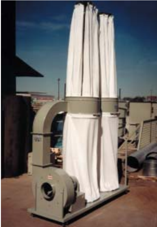
KTM S 22-12, KTM S 32-12, KTM S 52-12

Can be supplied with drums instead of bottom bags at no extra charge.