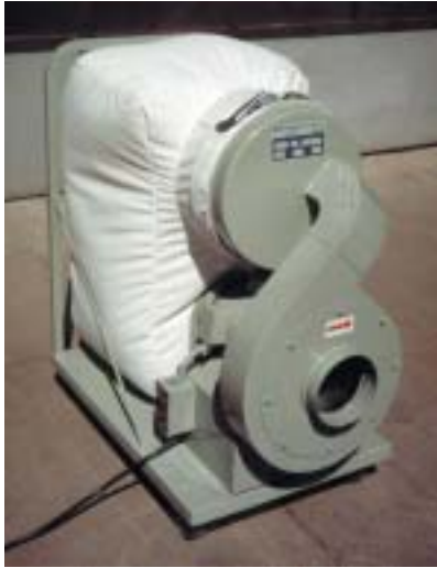
KTM S 1